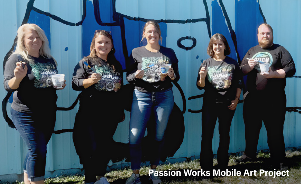
Passion Works Mobile Art Project