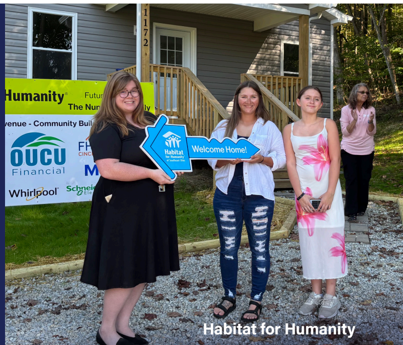
Habitat for Humanity