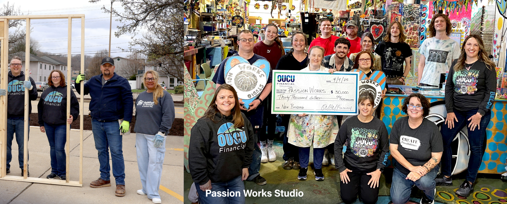
Passion Works Studio